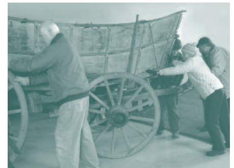
Volunteers help move a carriage into Historic Sugartown's Carriage Museum in central Willistown.